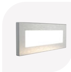
Brushed Chrome finish