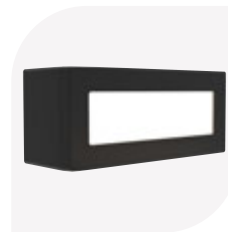
Installed with Surface Mounting Box (not available in brushed chrome)